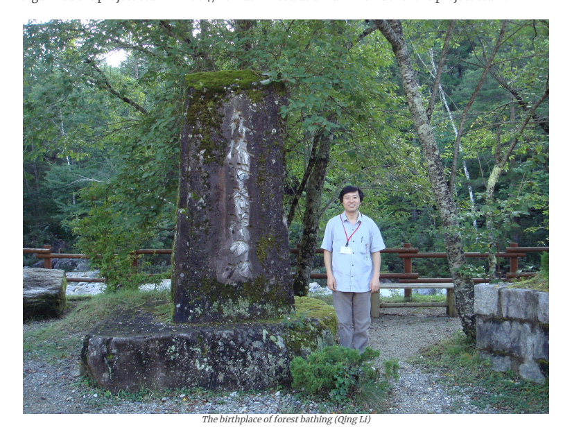
"I want to know why we feel so much better when we are in forests. What is this secret power of trees that makes us so much healthier and happier? Why is it that we feel less stressed and have more energy just by walking in the forest? I study forest medicine to find out all the ways in which walking in the forest can improve our well-being. I had the following hypothesis before the study of forest bathing:

Because of his background, when the Ministry of Agriculture, Forestry, and Fisheries of Japan organized the project team in 2004, he was invited as a main member of the project team.